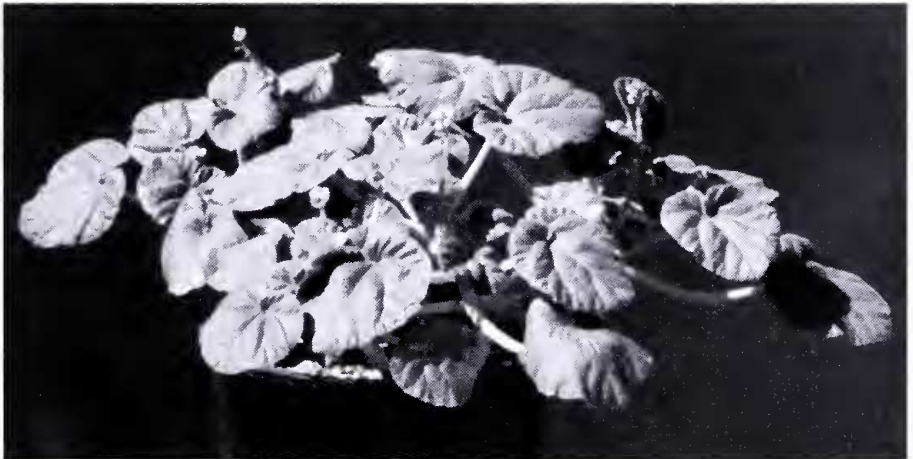
Figure 1: Ibicella lutea .

I have noticed Ibicella has two flowering phases during its long growing season. The first phase occurs when the plants are just a few months old. The fruit from this first phase of flowering mature in only a month or so. After these first few flowers, the plant stops flowering and concentrates upon growing larger. The second phase of flowering starts when the first crop of seeds are nearly mature. In my cultivation this phase continues until the plants are killed by frost. Fruit take up to three months to mature and grow to 16 cm or longer. Pollinate flowers from the first phase because you may not have the long growing season required to get seed from later flowers. Incidentally, Ibicella has sensitive stigmatic lobes that when touched, quickly flex out of the way and enclose the applied pollen. This is obviously an adaptation to avoid self-pollination by pollen-coated insects backing out of the flower. (It appears that moving stigma lobes only occur in the order Scrophulariales, which includes Ibicella and the carnivorous genera Pinguicula , Genlisea , and Utricularia .